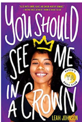
You Should See Me in a Crown Leah Johnson (YA JOH)