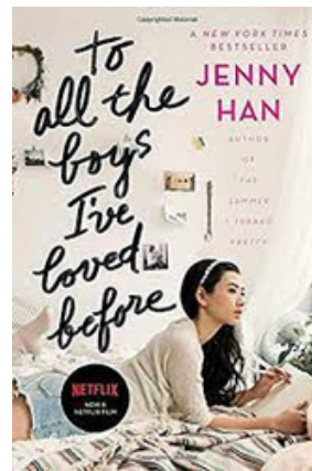
To All the Boys I've Loved Before Jenny Han (YA HAN)