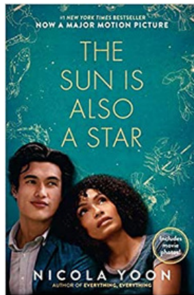
The Sun is Also a Star Nicola Yoon (YA YOO)