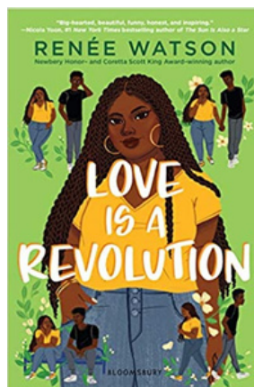
Love is a Revolution Renee Watson (YA WAT)